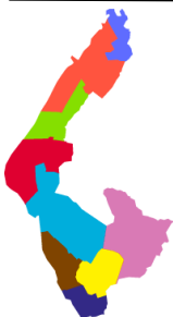
Areas covered by Sefton PCT

Henshaws Merseyside Resource Centre, Wellington Buildings, Liverpool, L2 0PP Tel: 0151 227 1226 E-mail: it-training@henshaws.org.uk Web : www.henshaws.org.uk